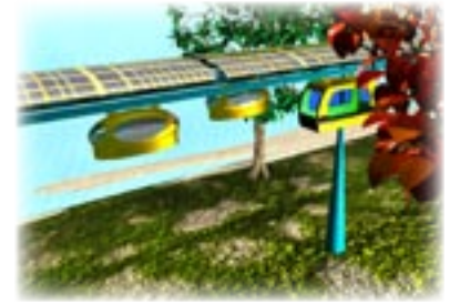
Solar Powered Mobility