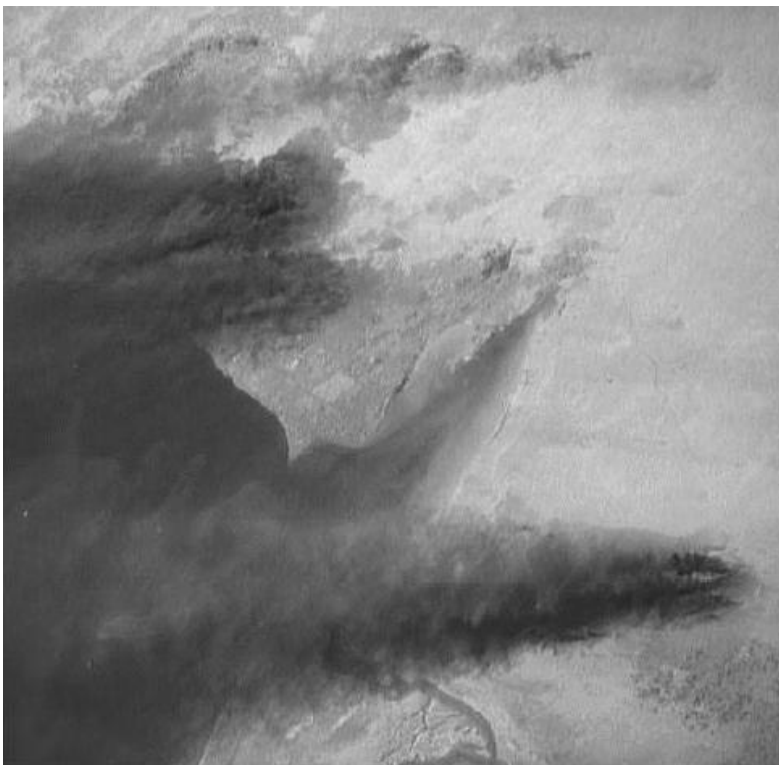
American dependence on imported oil has tied the fortunes of the United States to those of such volatile regions as the Middle East. In this photograph taken from the Space Shuttle Discovery on Sept. 18, 1991, smoke pours from Kuwaiti oil fields, which Iraqi forces had set ablaze in the waning days of the Persian Gulf War.

the IEA and SPR (the IEA would operate an oil rationing system among member states, allowing them to conserve and pool petroleum resources). With the current supply glut on the world oil market anyone suggesting the possibility of a price hike anytime soon is quickly greeted with ridicule. But then, who among the worshippers of the 1990s-style "utopian free trade" expected the Asian financial crisis or the recent slump of world financial markets? The fact remains that despite the numerous proclamations of a fundamentally "new economy" with permanent prosperity, supposedly created by a combination of deregulation, globalization, low inflation, and the high-tech information revolution, economic disruptions and distortions will continue to occur. The sputtering global economy has dampened demand for oil in the near term. However, it is not hard to imagine a scenario in the not-so-distant future when demand for oil in East Asia combined with instability in the Persian Gulf (where approximately 70 percent of the world's proven oil reserves are located) sends the price of crude on an upward trajec-