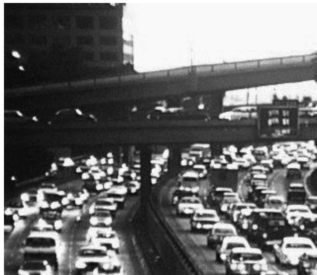
Travel delays may cost Americans up to $174.6 billion a year.

Uncompensated damages from accidents , or the portion of accident costs not borne directly by drivers, represent a major external cost of motor vehicle