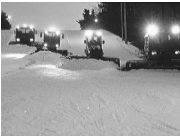
Annual road de-icing and runoff costs may reach $5.2 billion.

Noise pollution and vibrations created by motor vehicles impact the lives of millions of Americans daily. Noise is often overlooked as having an environmental or health impact, even though the external costs of motor vehicle noise are real (although difficult to quantify). Obviously, if noise were not considered a problem, there would be no need to build costly and unsightly barriers to protect homes and businesses from