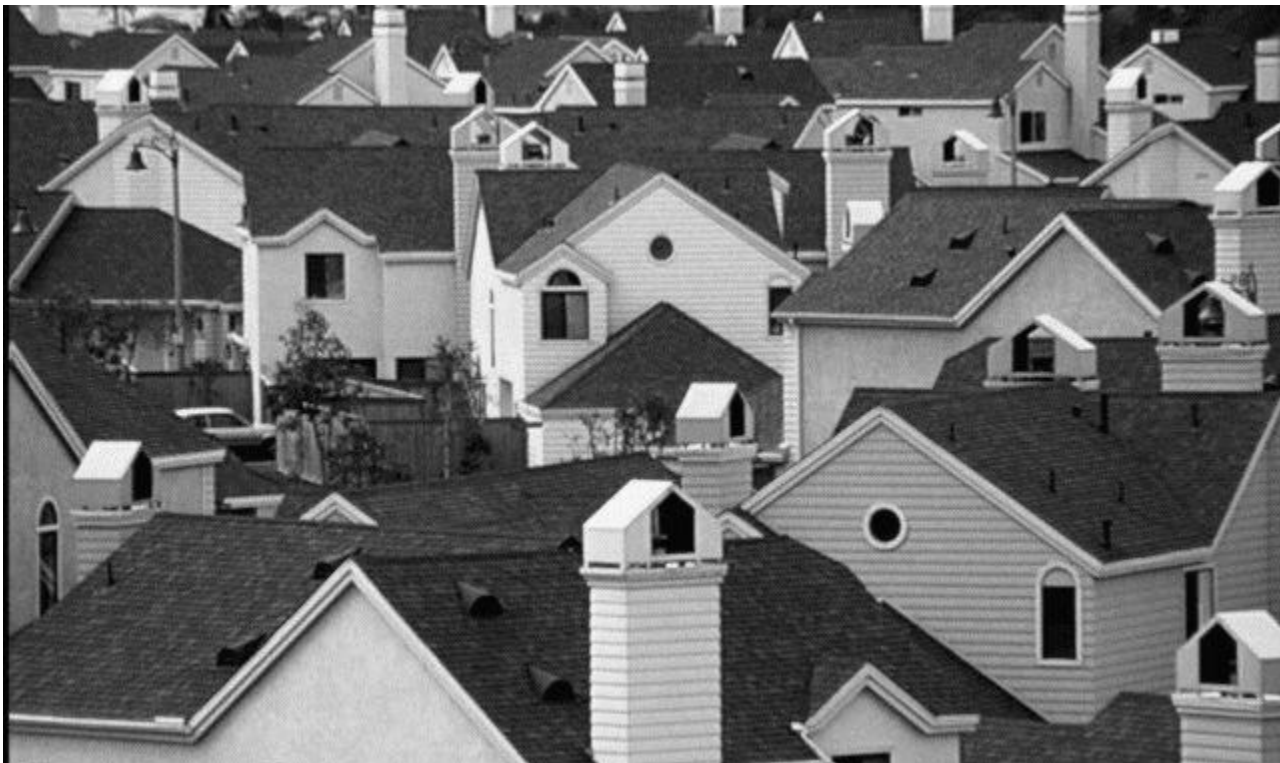
Suburban homogeneity is a result of an automobile-reliant culture and the associated development of sprawl.

The environmental impact of sprawl begins with the clearing and paving of land for roadways as the relentless march of development is set in motion. It is estimated that over 1 percent of the total surface area of the United States is paved roadways, parking areas, and driveways. 96 Automobile-dependent sprawl has serious consequences for wildlife habitats. Roads create barriers and fragment wildlife populations, re-