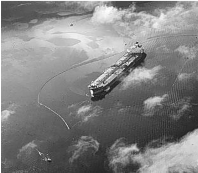
A major oil spill in 1989 involving the Exxon Valdez (above) led the government to increase petroleum companies' liability for oil spills. The cost paid by the public, however, remains high.

reduce excess liability costs that are borne by the public; however, significant subsidies to the oil industry remain. As well output declines, large oil companies often sell their leases to financially strapped independents that are unlikely to have the financial resources required to properly close their sites. The public pays an annual subsidy of $120 to $450 million in bonding premium shortfalls. 46 As the insurer of last resort, the federal government helps prevent these cleanup costs from increasing the price of gasoline. The annualized