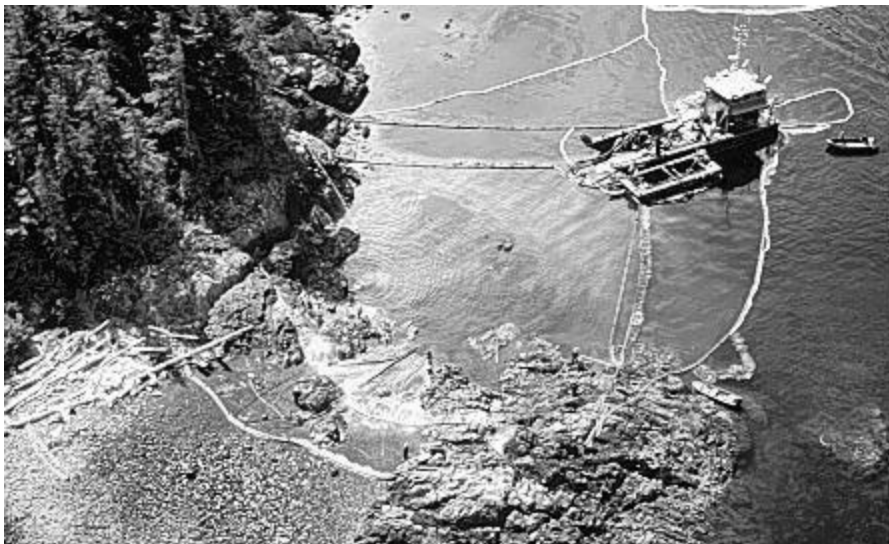
Cleanup in the aftermath of the Exxon Valdez disaster. The total cost of the spill probably exceeded $7 billion.

Water pollution can be linked to several aspects of the oil industry and the transport sector. As mentioned in the section on government program subsidies to the oil industry, leaking underground storage tanks (LUSTs) contaminate underground aquifers. Oil