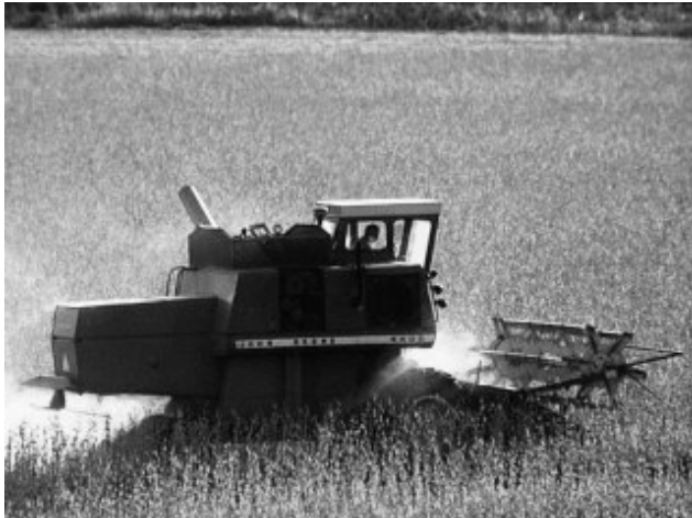
Auto pollution causes $2 billion to $4 billion worth of damage to agricultural crops each year in the United States.

This report relies on the estimates of environmental and social costs derived for the 1990-91 period by