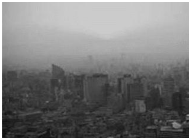
Urban haze obscures visibility in many large US cities. Other ramifications of auto pollution include human health problems and damage to buildings and other urban structures.

The American transportation sector is a driving force behind global climate change. After a trend during which cars’ average mileage per gallon increased from the 1970s until the late 1980s, the nation’s fleet of vehicles is getting less efficient in the 1990s. More and more Americans are driving oversized gas guzzling trucks, vans, and sport utility vehicles, many of