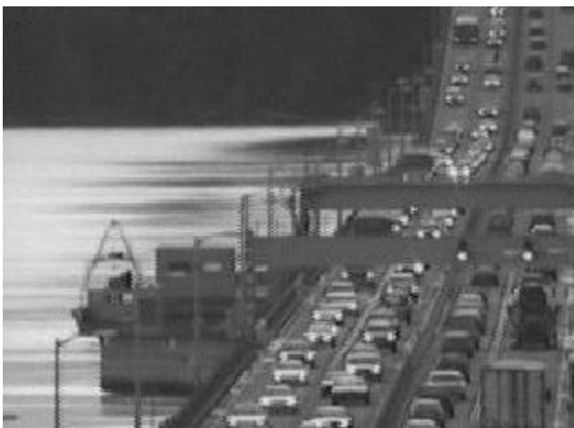
The growth of low-density suburbs has increased the amount of time commuters spend traveling to and from work (see chart, page 24) and sitting in traffic.

The social impacts of sprawl are perhaps somewhat subjective, but the evidence is visible in everyday life. Litman arrives at an annual cost of about $58 billion. Several researchers have argued that roads and traffic tend to degrade public spaces and reduce community interaction and cohesion. People living on heavily traveled roads are less likely to visit neighbors, and it is doubtful that anyone enjoys sitting on the front porch inhaling car fumes. Widening roads to optimize them for vehicle traffic tends to foster feelings of social alienation, placelessness , and isolation. Daniel Carlson, author of a book on land use, transportation, and communities argues that “automobile-based de-