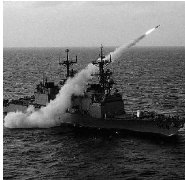
Up to $96.3 billion in US defense spending each year may go directly towards protecting overseas oil sources.

Many researchers have attempted to accurately determine the cost of America's defense of oil production and shipment throughout the world and specifically in the Persian Gulf. In the aftermath of the Gulf War, several analysts have also estimated the annualized cost of combat. In some years, the cost of