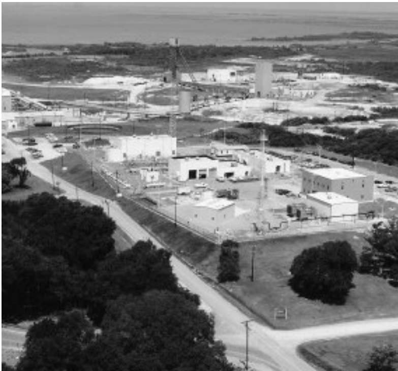
The Weeks Island Storage Site, located 95 miles southwest of New Orleans and formerly used as a salt mine by the Morton Salt Co., now serves as an integral part of the Strategic Petroleum Reserve, with the capacity to store up to 70 million barrels of oil. The graph on the following page represents SPR funding totals for 1976 through 1997.