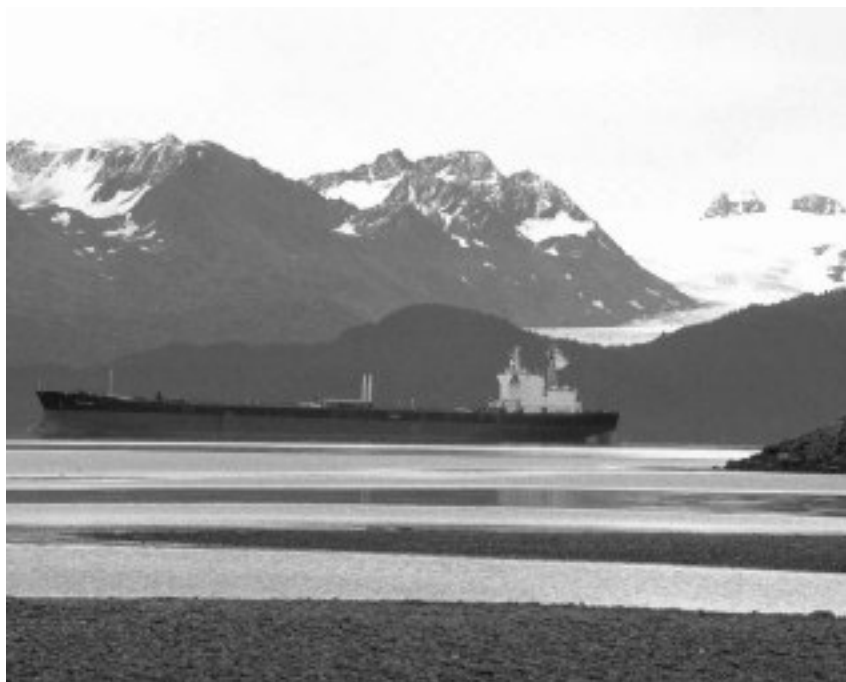
A massive tanker moves crude oil to a refinery on the way to gasoline pumps in the United States. A disruption in the flow of oil could have devastating financial repercussions.

A sudden change in the price of oil has the potential to seriously damage the US economy. The potential loss in GNP due to petroleum use arises from the "inability of the economy to adjust instantly to rapid changes in the price of oil." 113 The SPR offers protection against price and supply shocks for slightly over one month. While this provides some room to maneuver during short periods of market or security volatility, it cannot stop the economic consequences of longer-term price hikes. Rising petroleum prices result in rising transportation costs, which consumers end up paying for in the form of higher retail prices. Companies whose profit margins are sensitive to transportation costs are forced to pursue cost-cutting measures that may result in layoffs. Oil price hikes can trigger inflationary pressures as occurred during the 1970s. The higher cost of transport also has the potential to negate gains in productivity. The American economy is much more dependent on oil than those of comparably developed countries in Europe, which