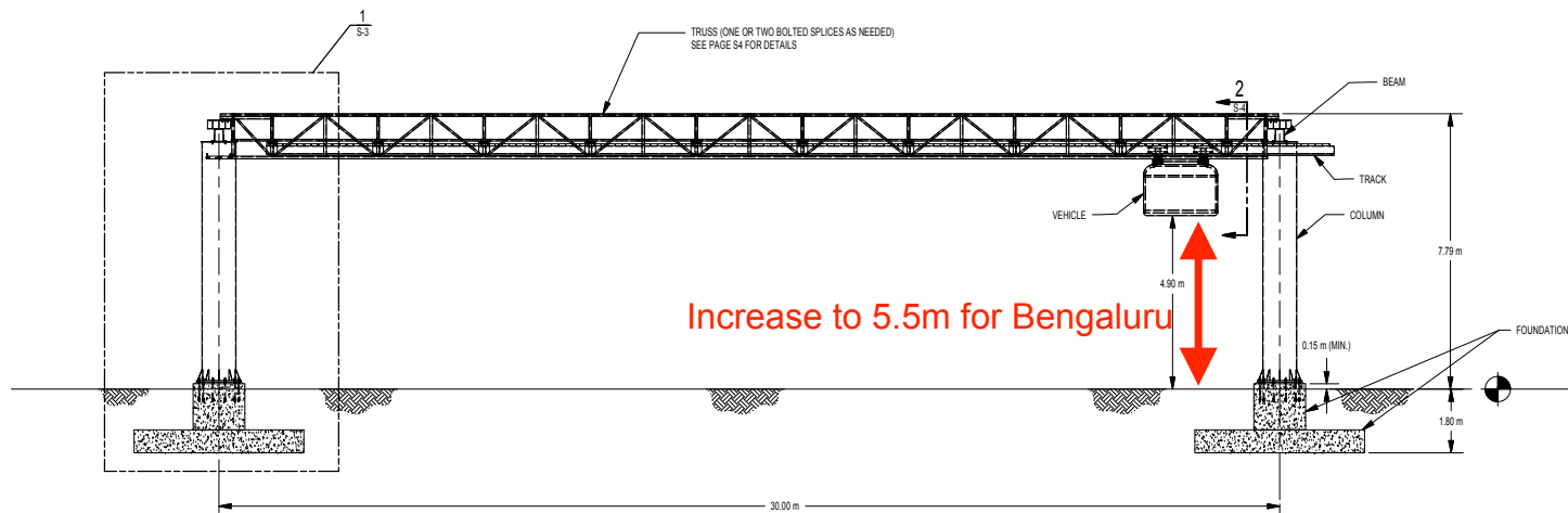
1 SIDE ELEVATION S-2 SCALE 1:75